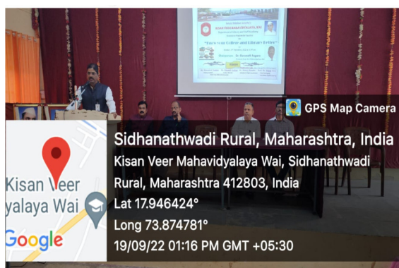
Hon. Principal Addressed the Faculties