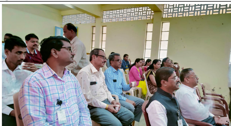
Faculty Members enjoying the Orientation Program